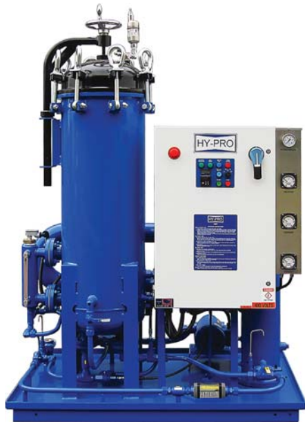
Hy-Pro's COT Turbine Oil Coalesce System

Clean up a temporary contamination issue or test out a system before you buy it. Contact us for details.